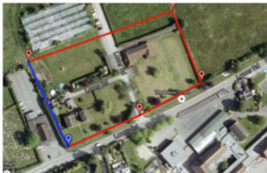
Site 1 Effingham Lodge Farm 1.2ha

In conclusion, EPC did not take on board EFFRA’s recommendations regarding the 12 other potential sites or our suggestions of the criteria to be used. Our criteria fully complied with the National Planning Policy Framework (NPPF) and Green Belt legislation.