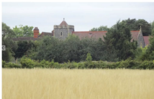
View of Our Lady of Sorrows across Effingham Lodge Farm - at risk

The five purposes are: 1. To check the unrestricted sprawl of large built-up areas, 2. To prevent neighbouring towns merging into one another, 3. To assist in safeguarding the countryside from encroachment, 4. To preserve the setting and character of historic towns and 5. To assist in urban regeneration by encouraging the recycling of derelict and other urban land.