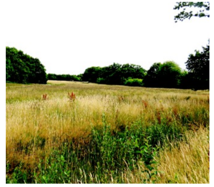
View across the north field, Effingham Common

Unfortunately, the plans for Heritage Open Day this year which is due to be held on Saturday 12th September are on hold and will depend on the COVID-19 situation.