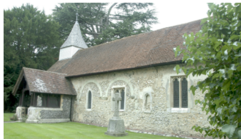
All Saints Church – Little Bookham