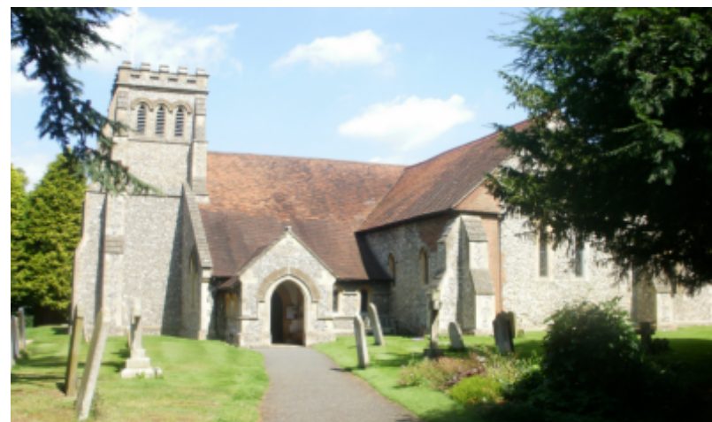
Saint Lawrence Church – Effingham

In the early medieval period Bishops spent much of their time making visitations of the churches in their diocese in processions on foot. This footpath which is shown on old maps joins the two churches and is likely to have been 'The Bishop's Walk'.